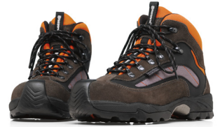
BOTTES DE PROTECTION TECHNICAL 575 35 47-47