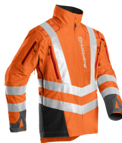
BRUSHCUTTING- AND TRIMMER JACKET, HIGH VIZ 597 24 59-62