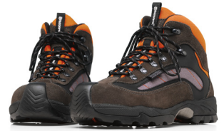
BOTTES DE PROTECTION TECHNICAL 596 30 64-39