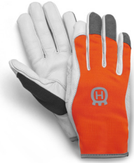
GANTS, CLASSIC LIGHT 596 31 06-09