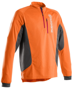
WORK T-SHIRT LONG SLEEVE, TECHNICAL 501 72 03-66