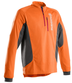
WORK T-SHIRT LONG SLEEVE, TECHNICAL 501 72 03-62