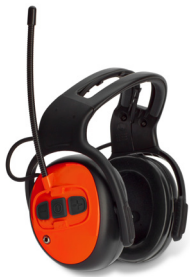
PROTECTION OREILLES AVEC RADIO FM 578 27 49-03