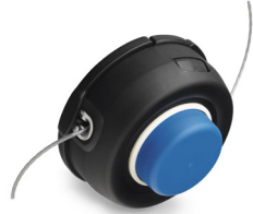
TRIMMER HEAD ERGO FEED 594 72 70-01