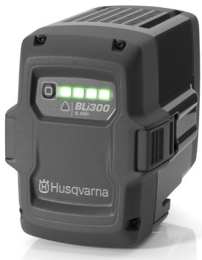
HUSQVARNA BATTERY BLI300 967 07 19-01