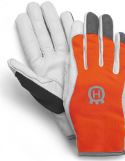
GANTS, CLASSIC LIGHT 596 31 06-08