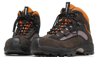
BOTTES DE PROTECTION TECHNICAL 596 30 64-47