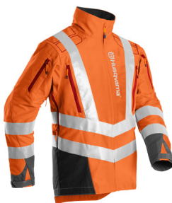
BRUSHCUTTING- AND TRIMMER JACKET, HIGH VIZ 597 24 59-58