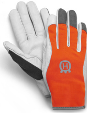
GANTS, CLASSIC LIGHT 596 31 06-07