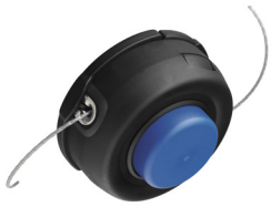
TÊTE NYLON SEMI AUTOMATIQUE TRIMMER HEAD T35X T35 578 44 64-01