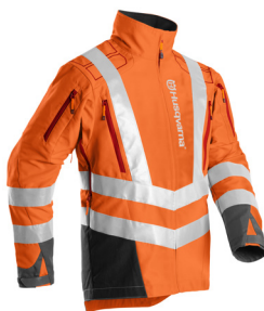
BRUSHCUTTING- AND TRIMMER JACKET, HIGH VIZ 597 24 59-54