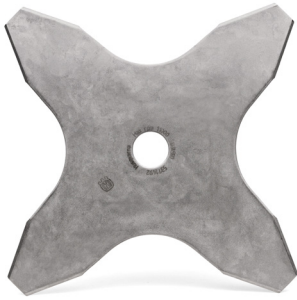
COUPEAU À HERBE 578 44 47-01