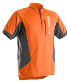
MODÈLE COURT TECHNICAL 501 71 59-46