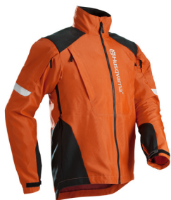
VESTE POUR TURBOFILS ET DÉBROUSSAILLEUSES, TECHNICAL 580 68 82-62