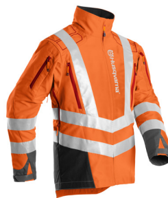
BRUSHCUTTING- AND TRIMMER JACKET, HIGH VIZ 597 24 59-46