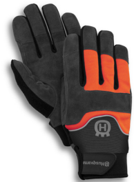
GANTS, TECHNICAL LIGHT 596 30 92-10