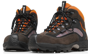
BOTTES DE PROTECTION TECHNICAL 596 30 64-38