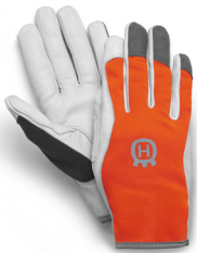
GANTS, CLASSIC LIGHT 596 31 06-10