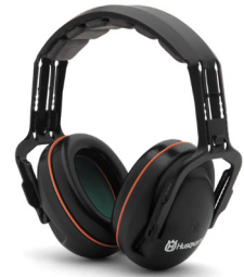
PROTECTEUR D'OREILLES, SERRE-TÊTE 505 66 53-04