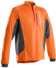
WORK T-SHIRT LONG SLEEVE, TECHNICAL 501 72 03-50