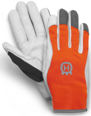
GANTS, CLASSIC LIGHT 596 31 06-06