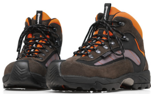
BOTTES DE PROTECTION TECHNICAL 575 35 47-37