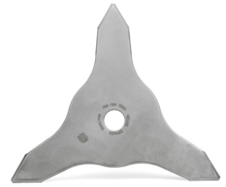
COUPEAU À HERBE, 3 DENTS 578 44 49-01