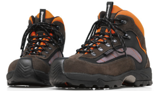
BOTTES DE PROTECTION TECHNICAL 596 30 64-43