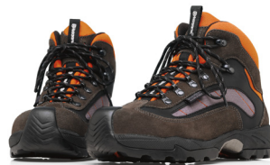
BOTTES DE PROTECTION TECHNICAL 596 30 64-46