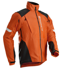
VESTE POUR TURBOFILS ET DÉBROUSSAILLEUSES, TECHNICAL 580 68 82-50