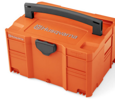
HUSQVARNA INVERTER VI600F 967 62 85-01