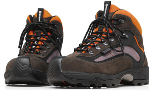
BOTTES DE PROTECTION TECHNICAL 575 35 47-45