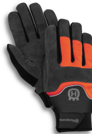
GANTS, TECHNICAL LIGHT 596 30 92-09