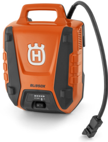
HUSQVARNA BLI950X 579 82 22-01