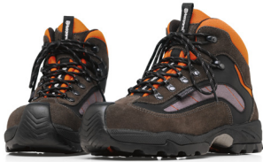
BOTTES DE PROTECTION TECHNICAL 596 30 64-40