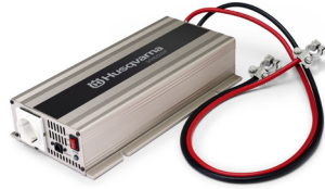
HUSQVARNA CHARGER QC500 970 44 95-01