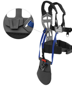
HARNES BALANCE XB 597 46 93-01