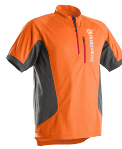
WORK T-SHIRT SHORT SLEEVE, TECHNICAL 501 71 59-50