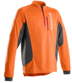
WORK T-SHIRT LONG SLEEVE, TECHNICAL 501 72 03-46