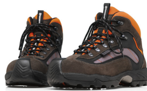
BOTTES DE PROTECTION TECHNICAL 575 35 47-42