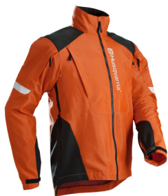
VESTE POUR TURBOFILS ET DÉBROUSSAILLEUSES, TECHNICAL 580 68 82-54