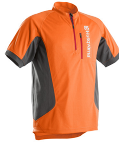
WORK T-SHIRT SHORT SLEEVE, TECHNICAL 501 71 59-66