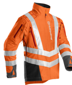
BRUSHCUTTING- AND TRIMMER JACKET, HIGH VIZ 597 24 59-50