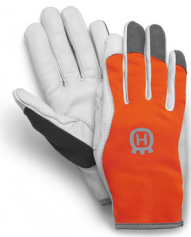
GANTS, CLASSIC LIGHT 579 38 00-09