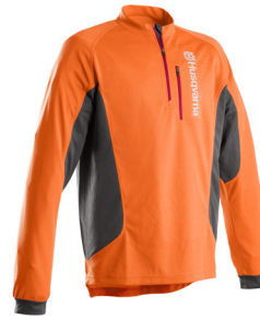
WORK T-SHIRT LONG SLEEVE, TECHNICAL 501 72 03-58