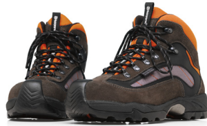
BOTTES DE PROTECTION TECHNICAL 596 30 64-41