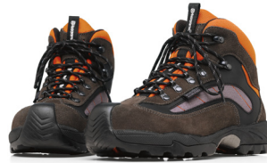
BOTTES DE PROTECTION TECHNICAL 596 30 64-42