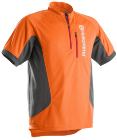
WORK T-SHIRT SHORT SLEEVE, TECHNICAL 501 71 59-58