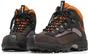
BOTTES DE PROTECTION TECHNICAL 575 35 47-44