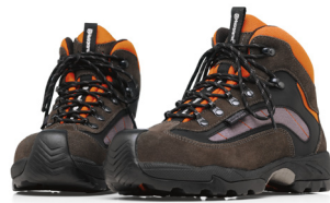
BOTTES DE PROTECTION TECHNICAL 575 35 47-41