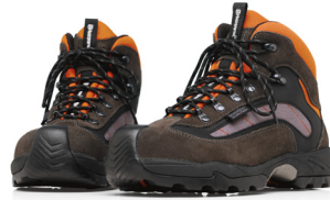
BOTTES DE PROTECTION TECHNICAL 575 35 47-46