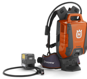
HUSQVARNA BLI950X 967 09 32-01