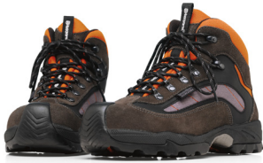
BOTTES DE PROTECTION TECHNICAL 596 30 64-36