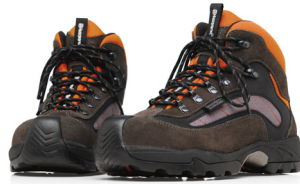
BOTTES DE PROTECTION TECHNICAL 596 30 64-37