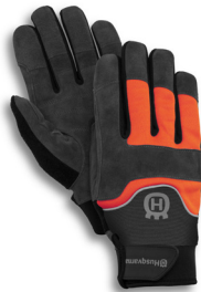
GANTS, TECHNICAL LIGHT 596 30 92-08