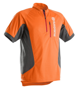
WORK T-SHIRT SHORT SLEEVE, TECHNICAL 501 71 59-54