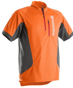
WORK T-SHIRT SHORT SLEEVE, TECHNICAL 501 71 59-62