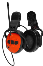
PROTECTION OREILLES AVEC RADIO FM 578 27 49-04