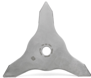
COUPEAU À HERBE, 3 DENTS 578 44 45-01