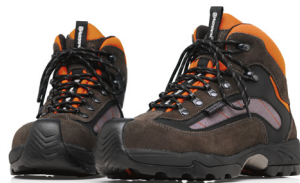
BOTTES DE PROTECTION TECHNICAL 596 30 64-45