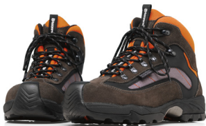
BOTTES DE PROTECTION TECHNICAL 596 30 64-44