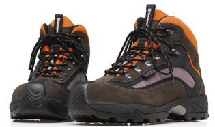
BOTTES DE PROTECTION TECHNICAL 575 35 47-43