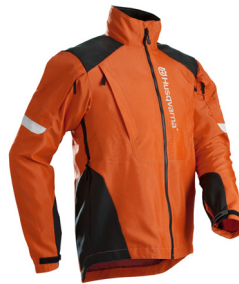
VESTE POUR TURBOFILS ET DÉBROUSSAILLEUSES, TECHNICAL 580 68 82-46