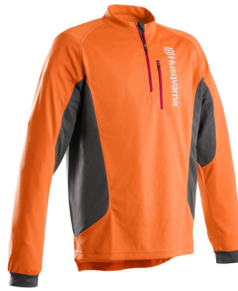
WORK T-SHIRT LONG SLEEVE, TECHNICAL 501 72 03-54